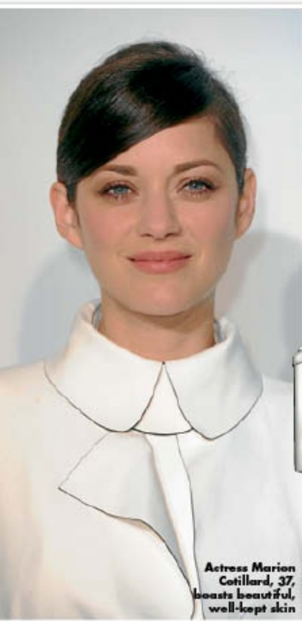
Actress Marion Cotillard, 37, boasts beautiful, well-kept skin

There are various opinions on the who, what and where of skincare but if you're a fan of layering , you may find that as the weather turns, one layer has to give, to stave off shine. If you are a BB Cream fan, or you wear a separate SPF (as opposed to a cream or foundation containing one) the solution may be to forgo moisturiser for a few months and use a hydrating, power-packed serum instead.